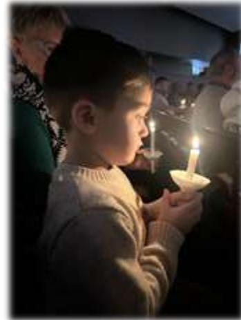
This young man pondered his lit candle with deep sincerity