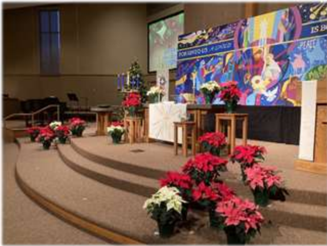
Poinsettias banked the altar area providing extra beauty

Four hundred believers chose to worship at St. Philip's Christmas Eve at one of two services. Candlelight, singing and reunion-like fellowship filled the air, as Jesus' birth became the prayerful focus.